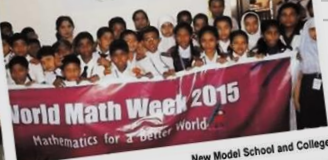
New Model School and College