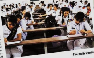
The math warriors