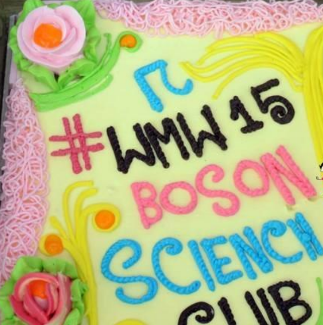
Celebration with Cake